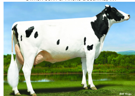
566HO1293 SEASAW Dam: Ladys-Manor SSH Seashell-ET "VG-87" DOM