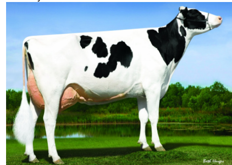
566HO1293 SEASAW Grandam: Seagull-Bay Mogul 1725-ET "EX-90"